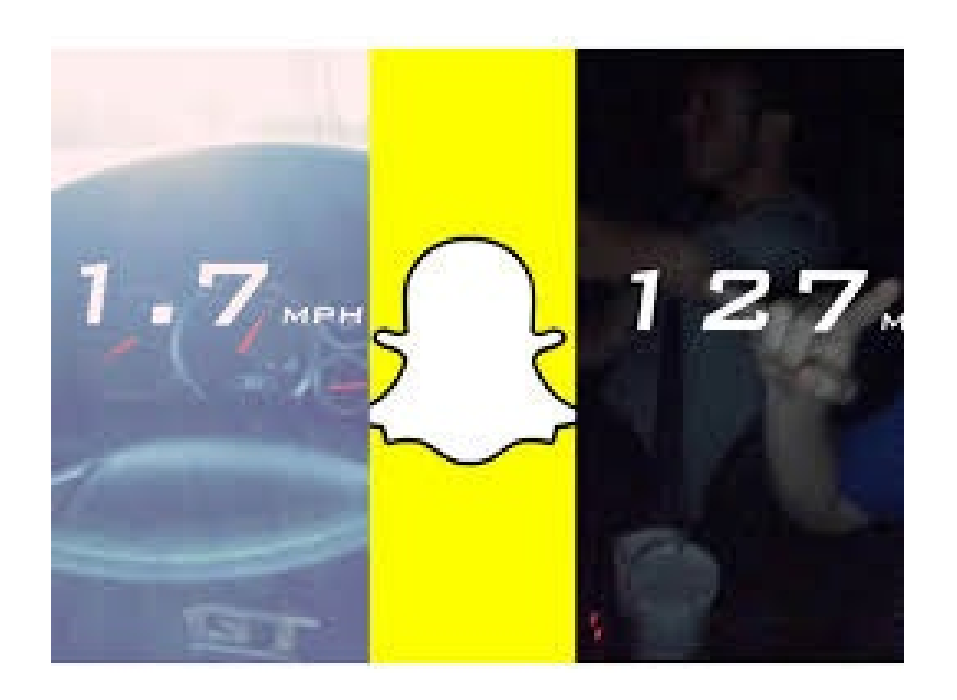
Snapchat Speed Filter