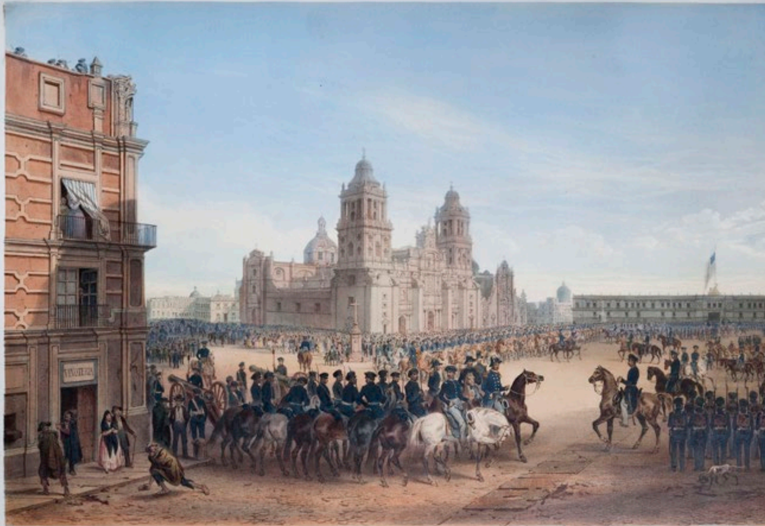
Genl. Scott's entrance into Mexico