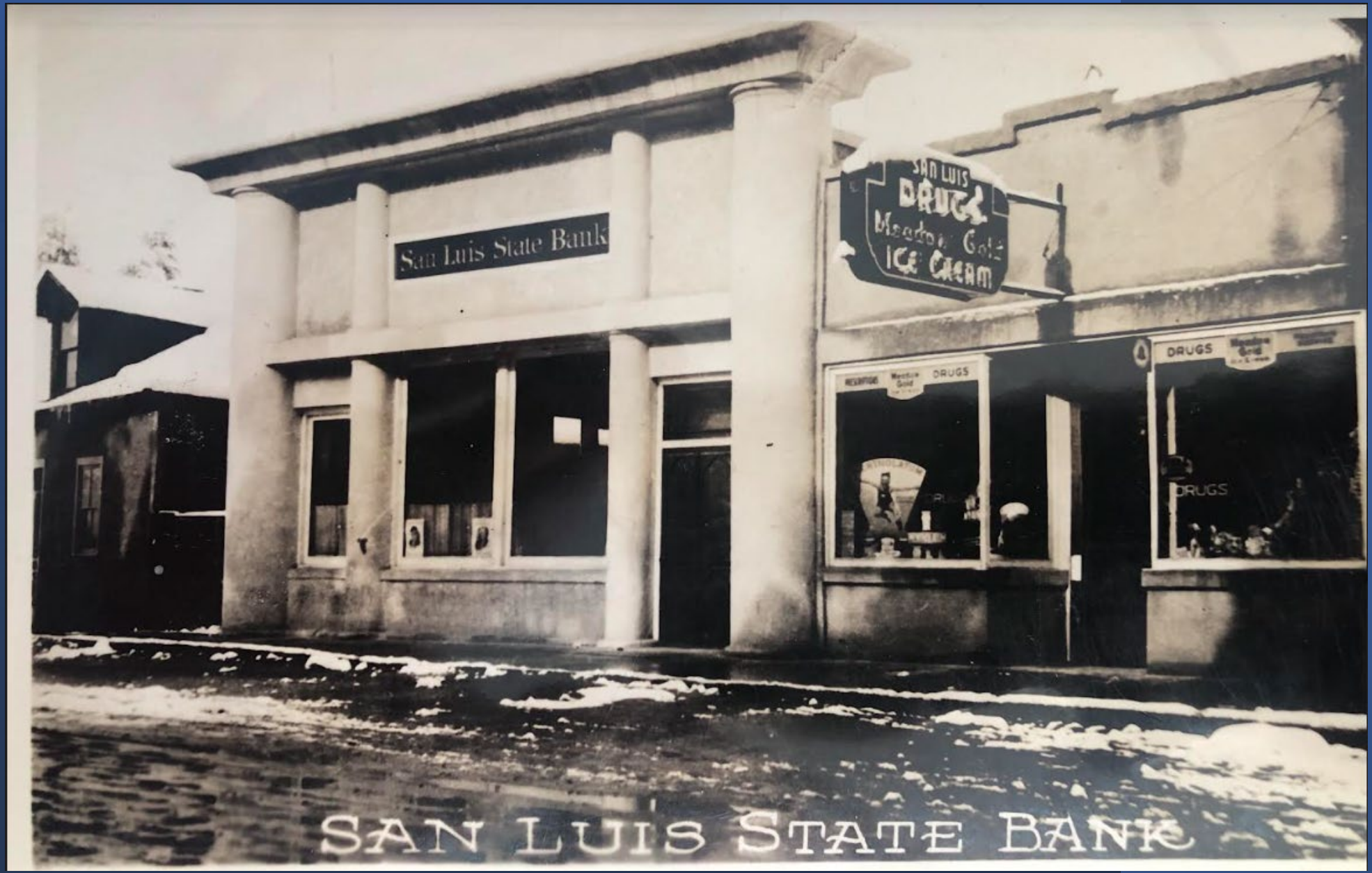
SAN LUIS STATE BANK